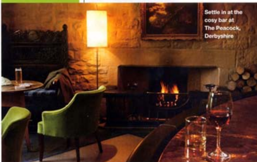
Settle in at the cosy bar at The Peacock, Derbyshire